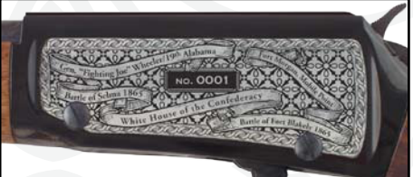
H004 "Golden Boy"